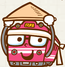
JR Johana Line Promotional Mascot "Jo-tan"

When you're taking the Shinkansen towards Tokyo, use the JR Johana Line to get to Shin-Takaoka Sta. and depart from there!